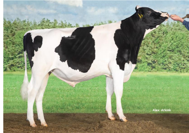
Delta Powerlift (Abundant P x Adorable)