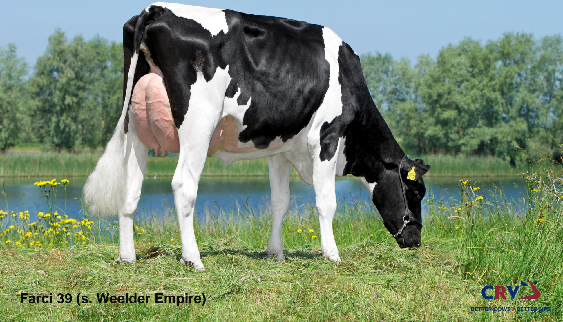
Farci 39 (s. Weelder Empire)