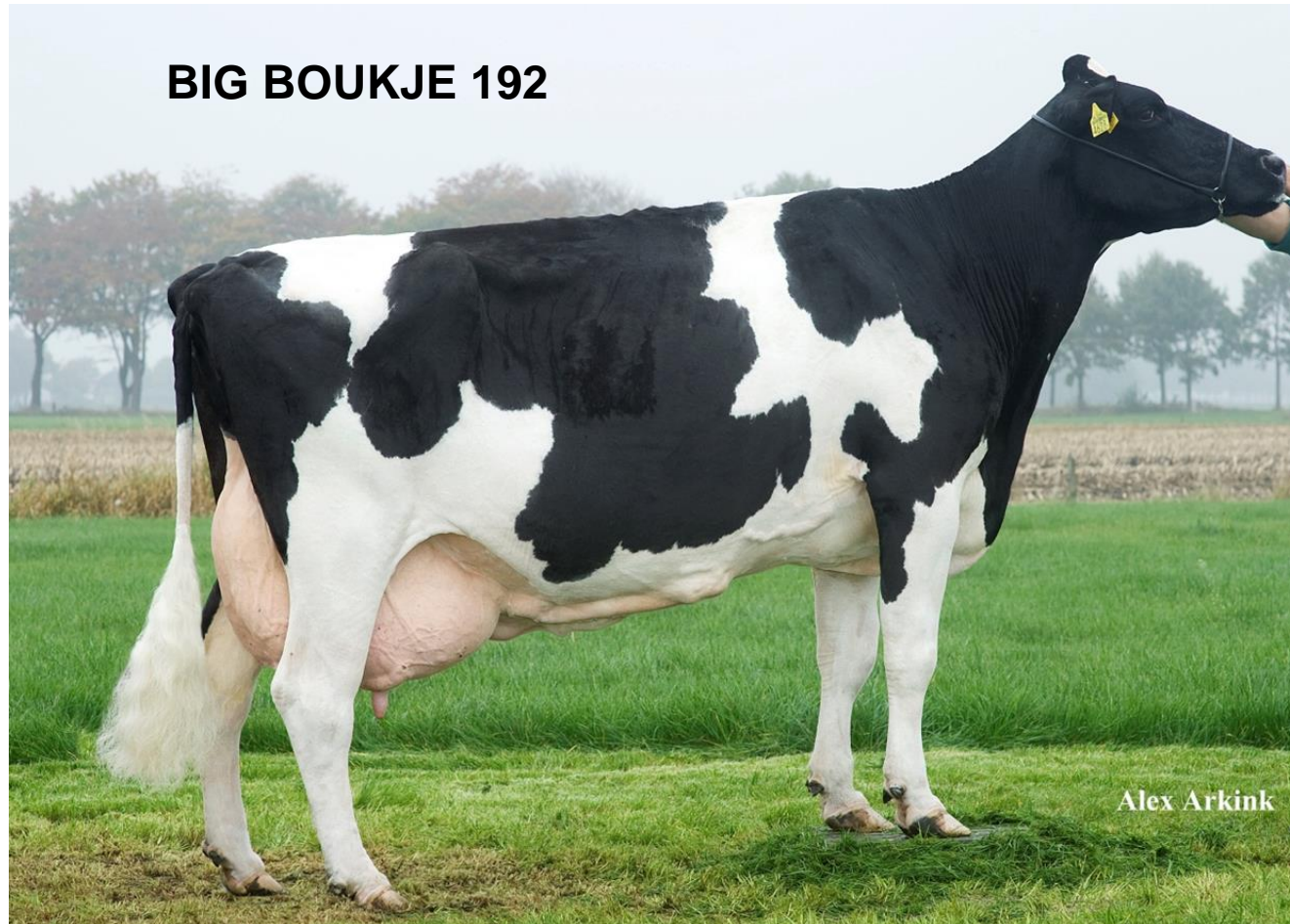
BIG BOUKJE 192

Healthy, Efficient cows with great lifetime production